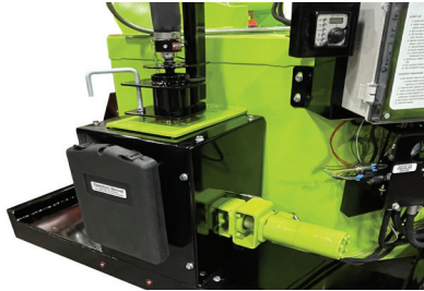
External heated 20 gpm material pump