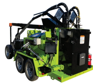
M4 with dual pump/dual hose option