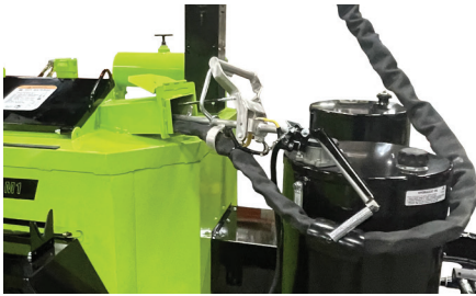
Front and rear recirculation ports