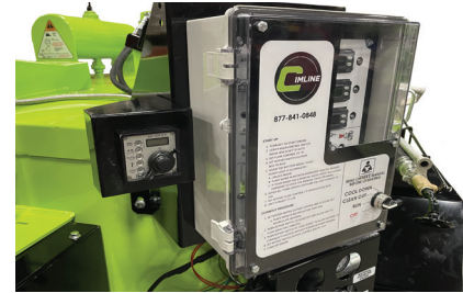
Convenient control panel and key switch