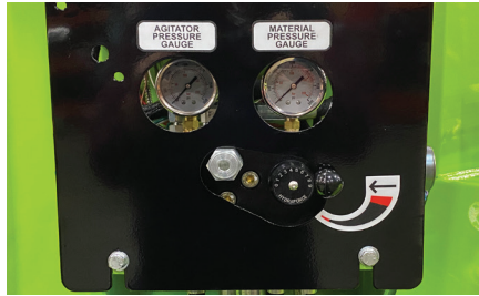
Variable material pump flow control