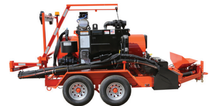
P2 Two-Person Patcher with DuraPatcher™ Technology