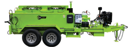
ME3 Mastic Melter Machine