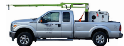
X2 Carry On Air Compressor