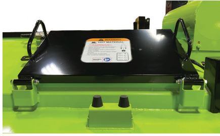
From 47 to 67 Inch Loading Door Height