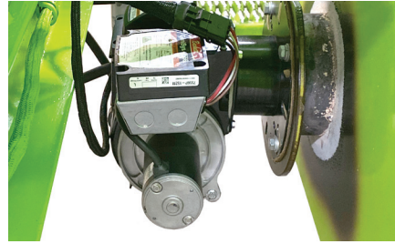
ME2 and ME3 with 340,000 BTU Diesel Material Tank Burner