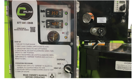
Simple Reliable Control System