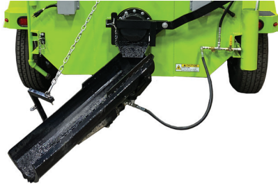
ME2 and ME3 Equipped with Wide Reach Propane Heated Chute