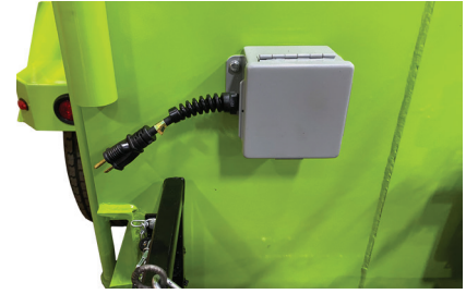
ME3 with Dual Overnight Heating Probes