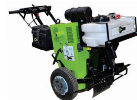
R3 Asphalt Crack Router