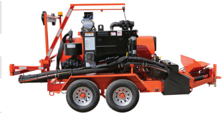
P2™ Two-Person Patcher with DuraPatcher™ Technology