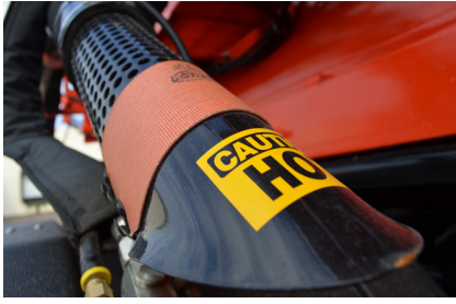
Vent-Flo™ Nozzle And Optional Heater