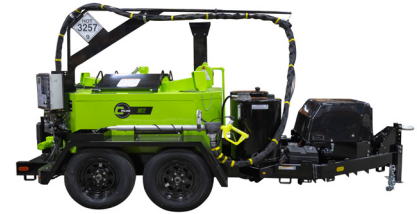
M2 230 Gallon Crack Sealer Melter Applicator