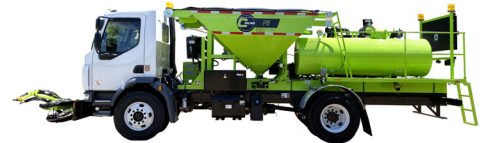
P5 One-Person Patcher with DuraPatcher Technology™