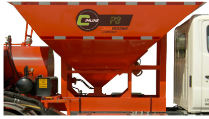
Six Yard Gravity Rock Hopper Capacity