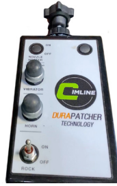
Simple And Easy Hand Controls