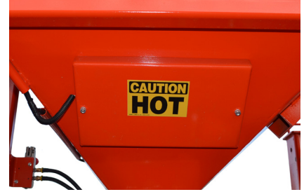
Hopper Heating System