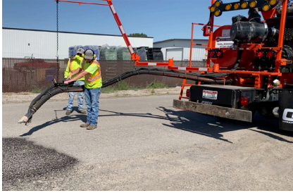
Ergonomic No-Stress Boom