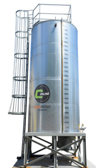
T-Series Stationary Tanks

Due to continuous improvement, specifications are subject to change without notice.