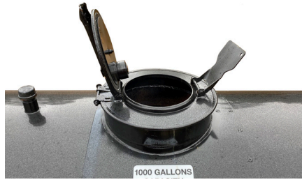
Large 14" Lockable Tank Fill Port