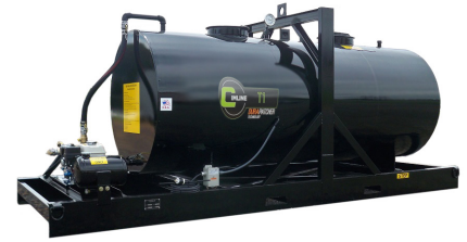
Skid Model Available