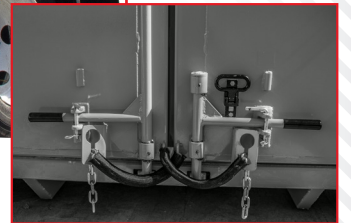
Dual Locking Mechanism